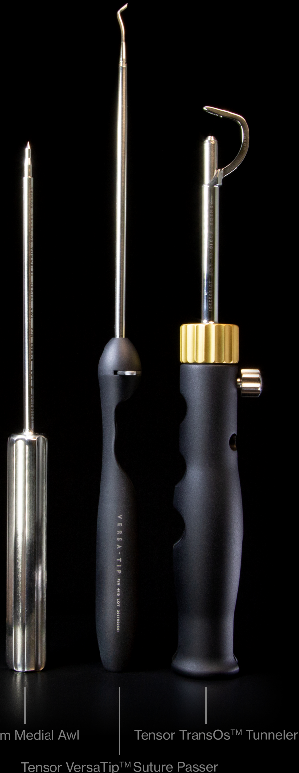
2.9mm Medial Awl

Strength and outcomes equivalent to double row anchor repair with no anchor cost!